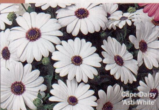
Cape Daisy 'Asti White'

Pretty pairings: Gorgeous at the base of taller shrubs, including other roses. Lower-growing lavender or veronica will mingle well with 'Pink Supreme.'