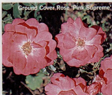
Ground Cover Rose 'Pink Supreme'