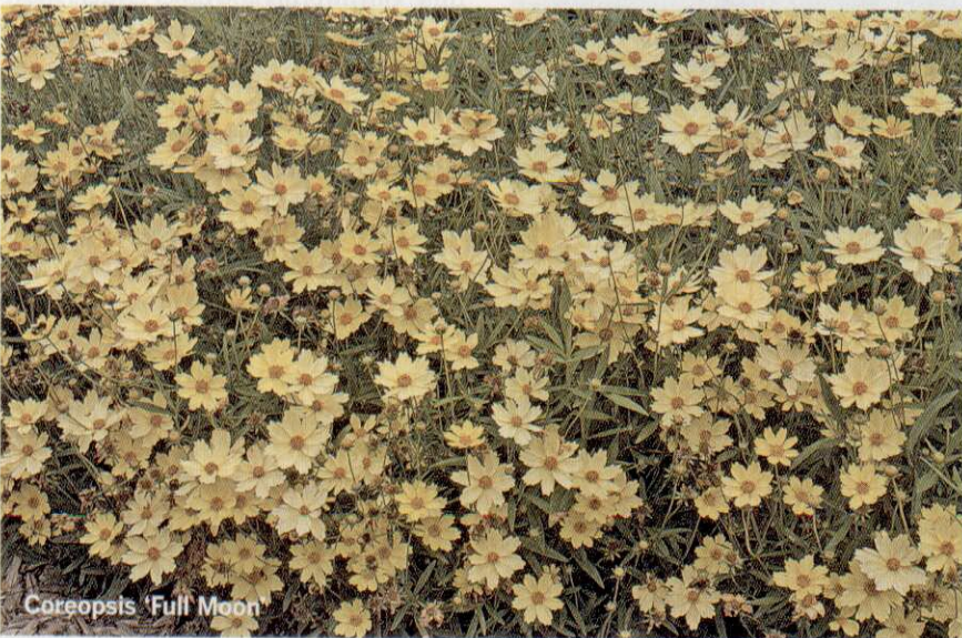
Coreopsis 'Full Moon'

What's new: An improved 'Moonbeam,' with canary-yellow color and larger, 3-inch blooms.