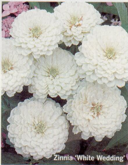
Zinnia 'White Wedding'