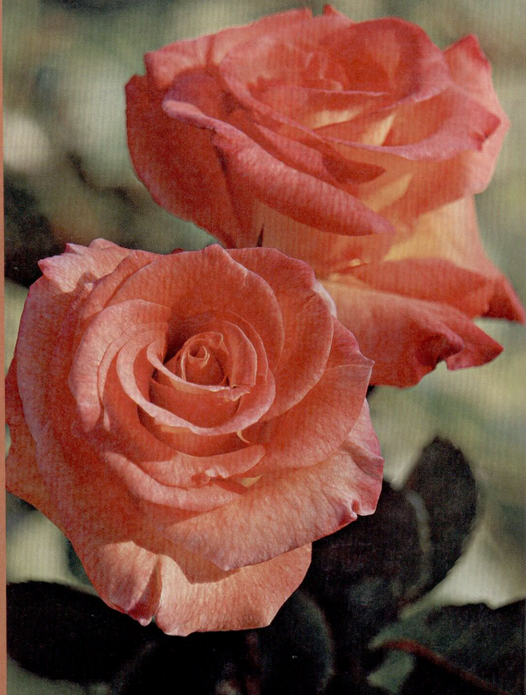
Floribunda Rose 'Mardi Gras'

To help you pick through all the new plants clamoring for your attention this spring, we've surveyed the crowd and selected some that look especially unique or top-quality. Details follow, along with some "pretty pairings" for each, making it even easier for you to boost your garden's beauty in 2008.