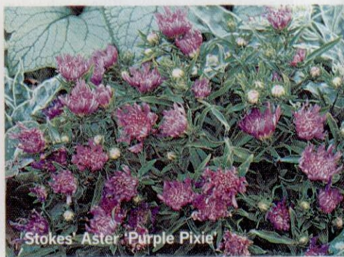
Stokes' Aster 'Purple Pixie'