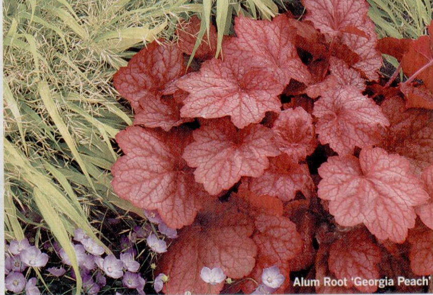
Alum Root 'Georgia Peach'

Size: 18 to 24 inches high; 24 to 28 inches wide.