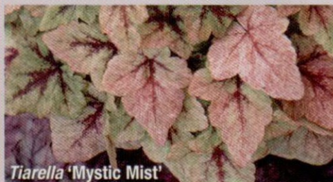
Tiarella ‘Mystic Mist’