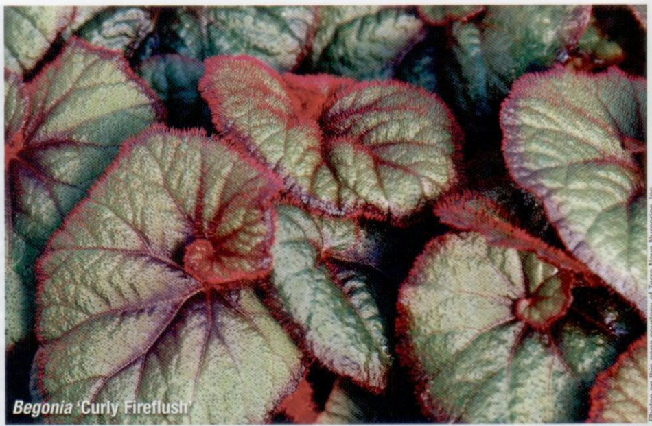
Begonia ‘Curly Fireflush’

I think it’s hard to find a less-than-terrific pulmonaria. Despite warnings to the contrary, in my Zone 8 garden Pulmonaria longifolia ssp. grows disease-free and large, even when neglected in periods of drought. The mottled silver lance-shaped leaves shine and cool down summer heat and afford interesting contrast with hostas and other shade or part-shade garden plants. The pink and blue flowers that rise above the plants in early spring echo the color of flowering bulbs, roses, and perennials. The landscape value of this faithful plant extends to planting beneath high arching shrubs and in mixed borders, and it thrives in pots, where it can be easily root pruned. ‘Silver Bouquet’™ pulmonaria is an improved version of the species, bred for better markings, much larger flowers that turn from pink to blue, and more dramatic markings on its slightly shorter leaves that give the variety a more mounding habit. It also has increased mildew resistance.