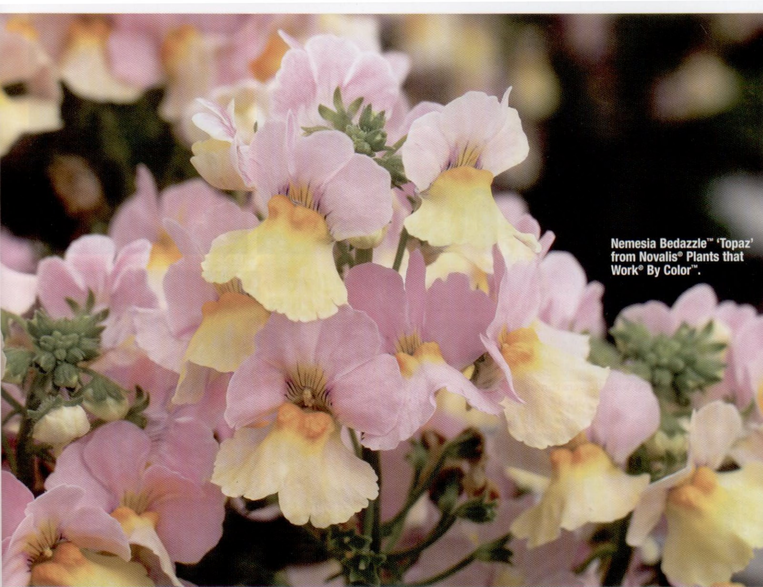
Nemesia Bedazzle™ 'Topaz' from Novalis® Plants that Work® By Color™.