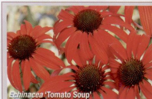
Echinacea ‘Tomato Soup’