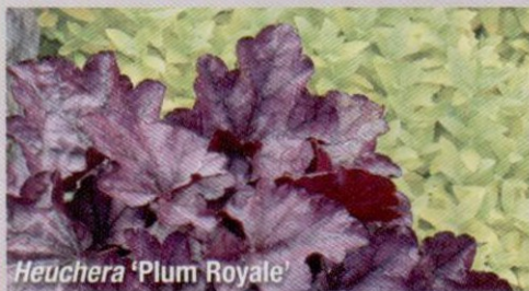
Heuchera ‘Plum Royale’