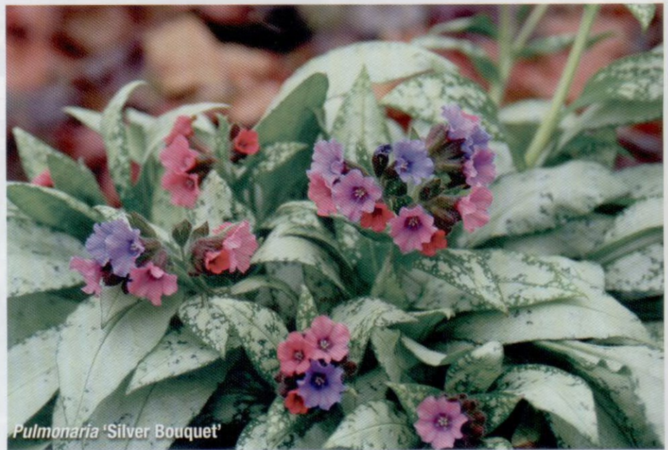
Pulmonaria ‘Silver Bouquet’