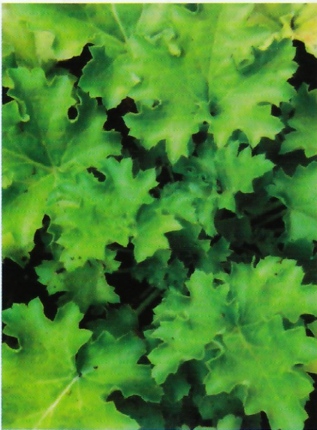
Heuchera 'Lime Rickey' (PP16,210)

A botanist, Tom Krischan grows tropical houseplants and tends a 1-acre flower garden in Big Bend, Wis.