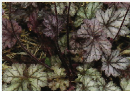
Heuchera 'Gypsy Dancer' (PP15,959)