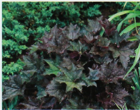
Heuchera 'Palace Purple'