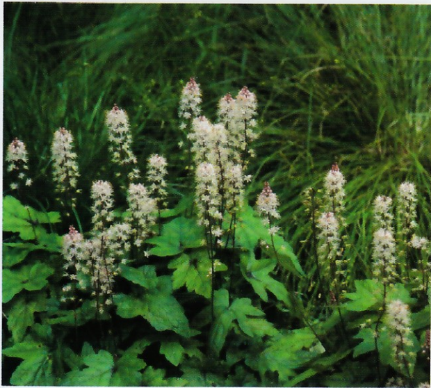
Tiarella 'Mint Chocolate' (PP11,379)