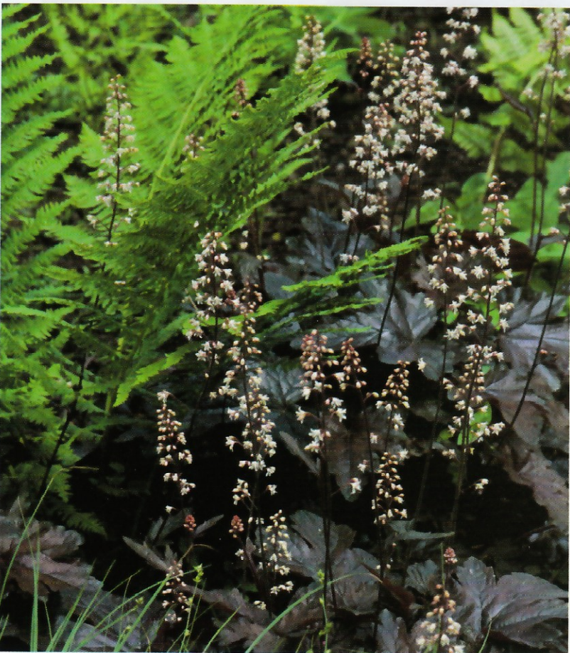
xHeucherella 'Burnished Bronze' (PP12,159)