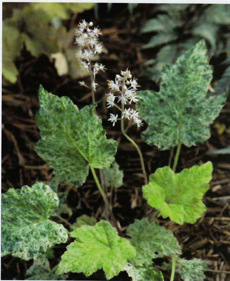
Tiarella wherryi 'Heronswood Mist'