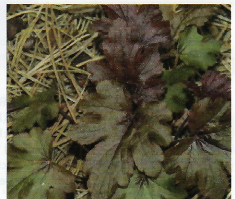
xHeucherella 'Chocolate Lace'