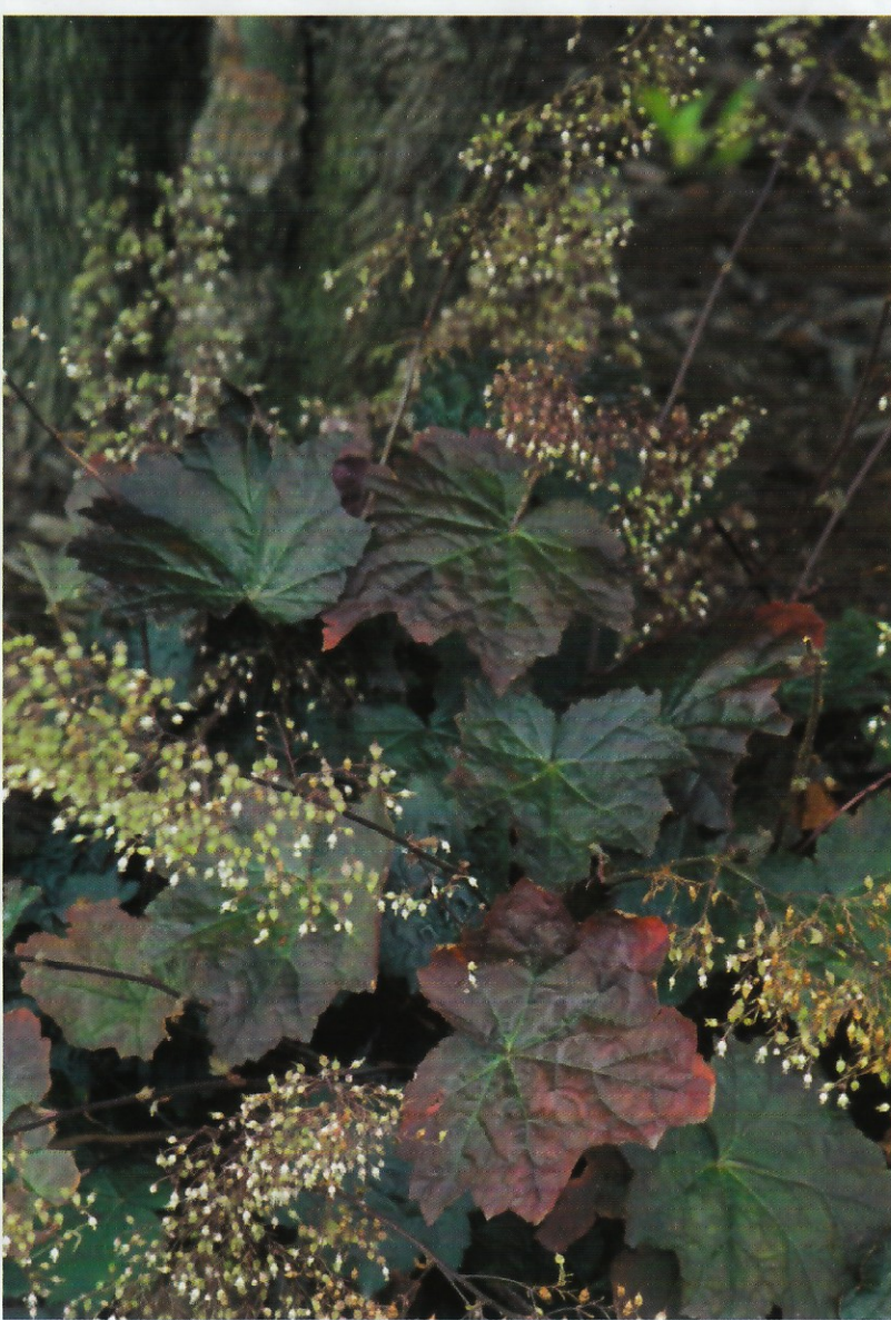
Heuchera 'Palace Purple'