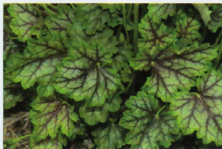
Heuchera americana 'Ring Of Fire'