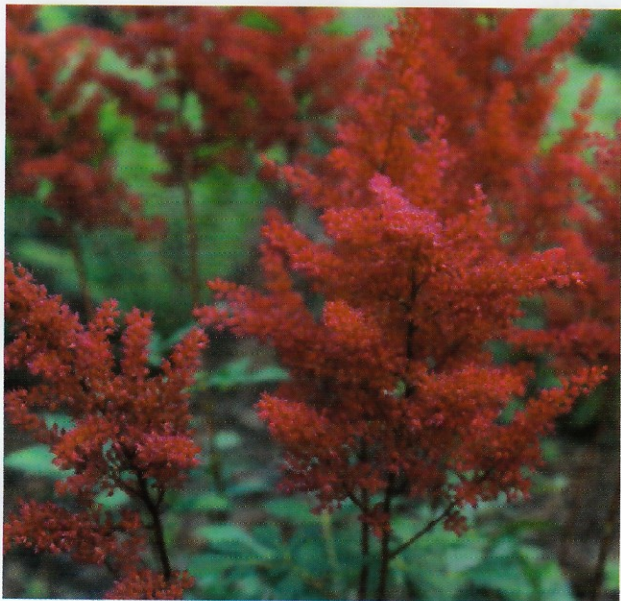
Astilbe japonica 'Red Sentinal'