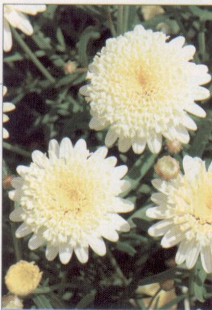
LaRita Double Lemon

Four varieties join the Argyranthemum frutescens LaRita series from Selecta First Class, bringing the series to nine medium-vigor varieties. Double Lemon performs great outdoors. Dark Pink has single flowers with