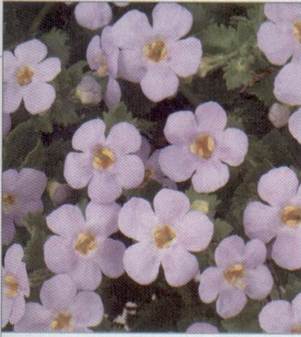
Scopia Gulliver Blue Sensation

Danziger "Dan" Flower Farm's Scopia Gulliver Blue Sensation produces masses of giant, light-blue flowers on a compact, branched plant. It has a mounded-trailing growth habit.