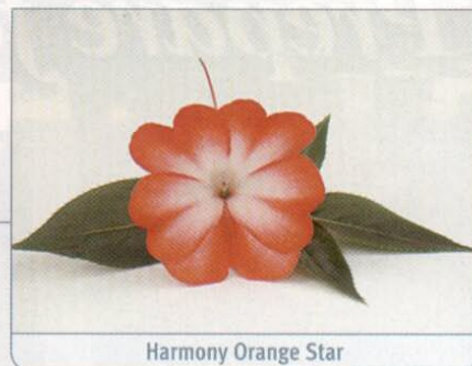
Harmony Orange Star