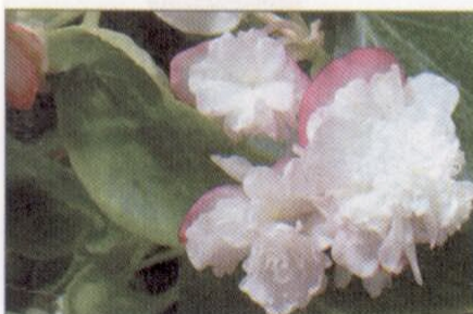
Gumdrop Cherry Blossom

Double-flowered wax begonia Gumdrop Cherry Blossom has soft, fully double flowers