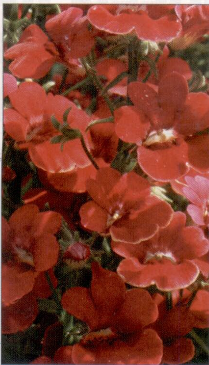
Serengeti Sunny Red

Selecta First Class' Serengeti series went through an overhaul. White, Sunset and Upright Yellow were improved. Additions