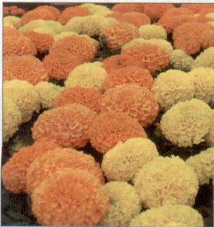
Discovery Orange and Discovery Yellow

compact habit that commercial growers highly covet. Flowers have been improved so that round, tight flower heads appear atop tidy plants.