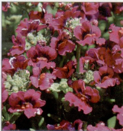
Serengeti Upright Purple

are Sunny Red, Upright Purple and Upright Violet + White . Large, scented flowers appear all summer.