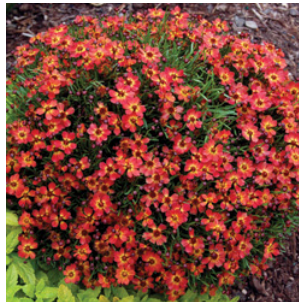
Coreopsis Terra Nova Nurseries, Inc.