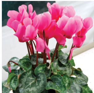
Cyclamen Hem Genetics