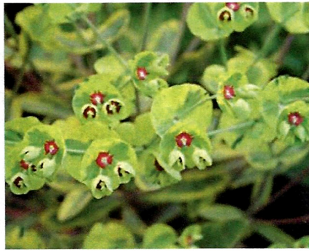
Quality Cuttings Team Euphorbia x martinii 'Watersaver Ascot Rainbow' 'Ascot Rainbow' sports cream, lime, and green flowers, while the foliage displays tones of cream and blue green with stunning red-pink coloring throughout cooler months. It has extreme tolerance to heat and dryness.