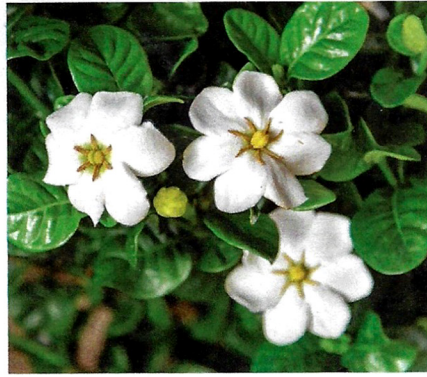
Southern Living and Sunset Western Plant Collections Gardenia 'Diamond Spire Leefive' A unique columnar gardenia, 'Diamond Spire Leefive' is cold hardy to Zone 7. It is 3- to 4-inches tall and 2-inches wide with heavy-blooming fragrant flowers from spring to fall.