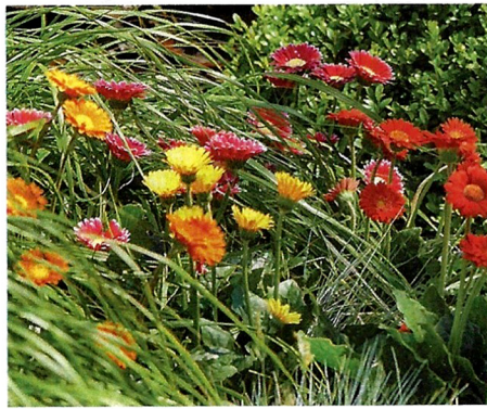
HilverdaFlorist Garvinea Cheeky Series This small-flowered series consists of four strong colors: Magenta, Orange, Red, and Yellow. The Cheeky Series creates up to 60% more flowers than large-flowered Garvinea.