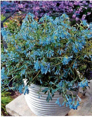
Plant Haven Corydalis 'Hillier Porcelain Blue' Vibrant aqua-blue flowers dance above the blue-green and bronze foliage of Porcelain Blue. It blooms from spring to early summer.