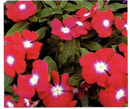
Hem Genetics Catharanthus roseus 'Solar Avalanche Cherry Dazzling Eye' Cherry Dazzling Eye has large, bold, cerise-red flowers with overlapping petals that are enhanced by a large white center. The series includes nine colors.