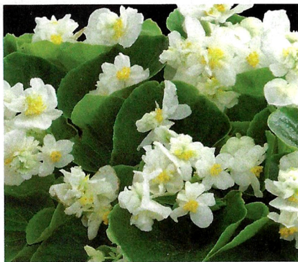
Begonia 'Fiona Pink' and 'Fiona White' The Fiona series features semi-double type, strong, upright flowers. Plants are self-cleaning and provide continuous color from summer to first frost.