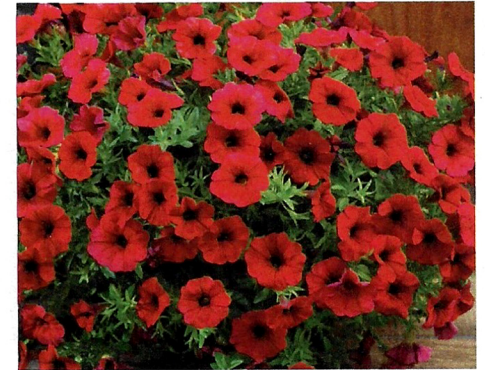
Petunia 'SuperCal Rose' and 'SuperCal Royal Red' These all-weather performers stand up to rain and shine and heat and cold spring through frost. With rapid rain recovery, SuperCal bounces back with strong performance.