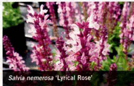
Salvia nemerosa 'Lyrical Rose'