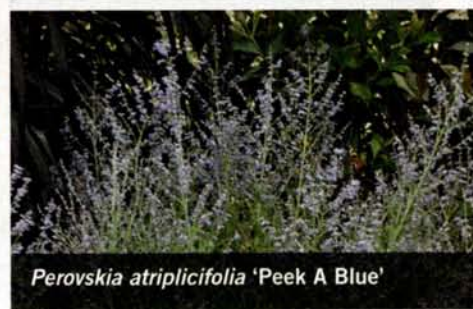
Perovskia atriplicifolia 'Peek A Blue'