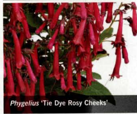
Phygelius 'Tie Dye Rosy Cheeks'