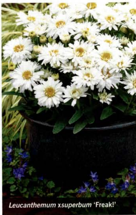
Leucanthemum xsuperbum 'Freak!'

What's new in the perennial world? A little bit of everything, from dwarf varieties of monarda and perovskia to a grower-friendly veronica.