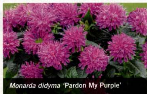
Monarda didyma 'Pardon My Purple'