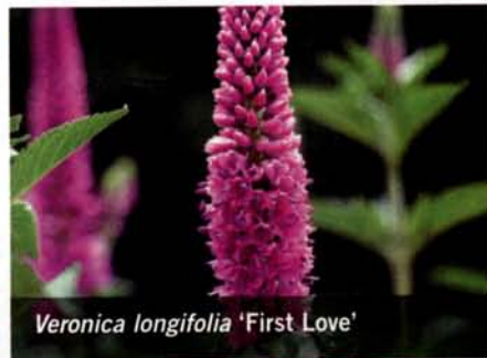
Veronica longifolia 'First Love'