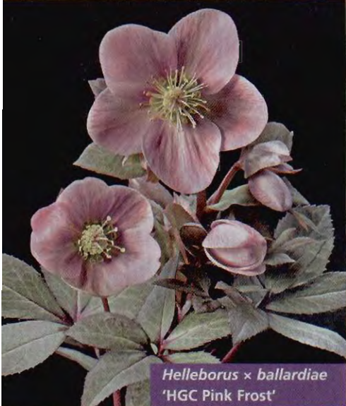
Helleborus × ballardiae 'HGC Pink Frost'