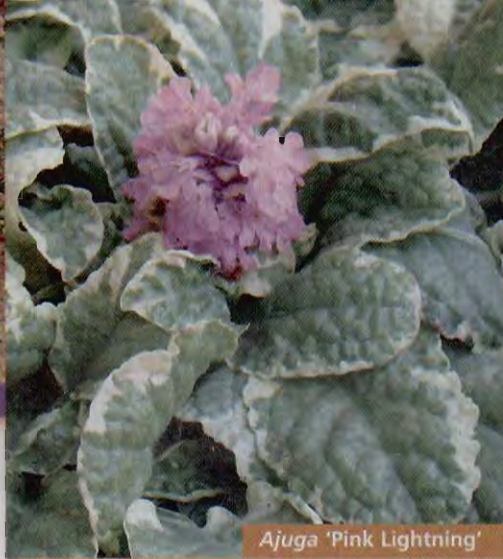
Ajuga 'Pink Lightning'