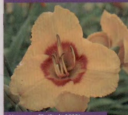
Hemerocallis 'Petit 0602' (Kokomo Sunset™ Enjoy 24/7®)