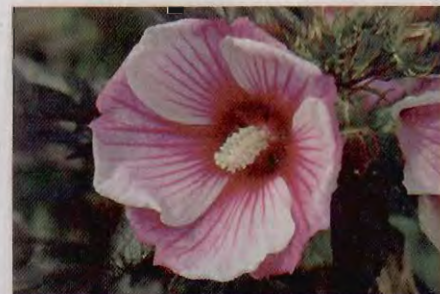
Hibiscus moscheutos 'Small Wonder'

Habit and growth rate: Extremely compact; medium to vigorous growth; 2½ feet tall and wide