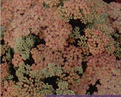
Achillea 'Peachy Seduction'