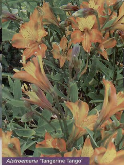
Alstroemeria 'Tangerine Tango'

Propagation methods: Grafting; easier to propagate than A. shirasawanum 'Aureum'