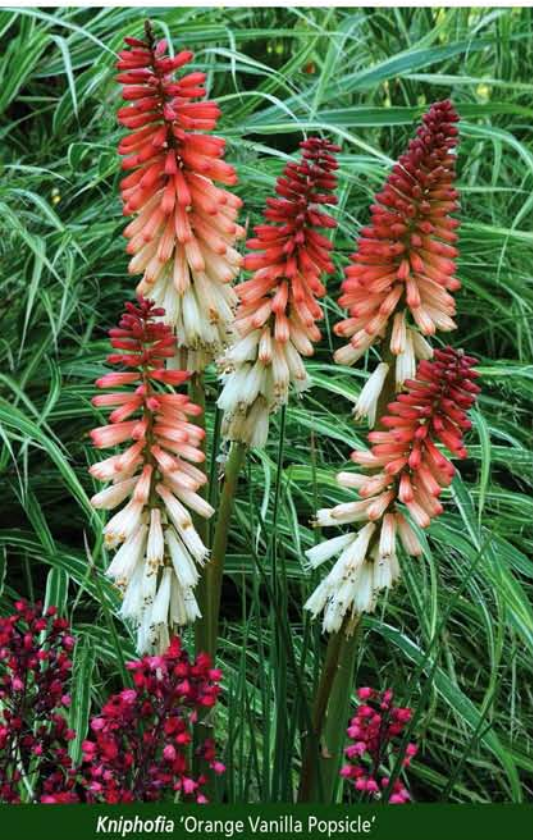
Kniphofia 'Orange Vanilla Popsicle'