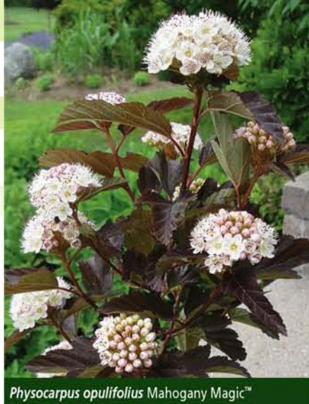
Physocarpus opulifolius Mahogany Magic™

Mail: P.O. Box 157, Lakeshore West P.O., Oakville, Ont., Canada L6K 0A4 Office & Warehouse: 5204 Trafalgar Rd., Milton, Ont., Canada L0P 1E0 Phone (905) 878-4244 --Fax (905) 878-7888 Sales 1-888-769-TIMM (8466) www.timmenterprises.com sales@timmenterprises.com