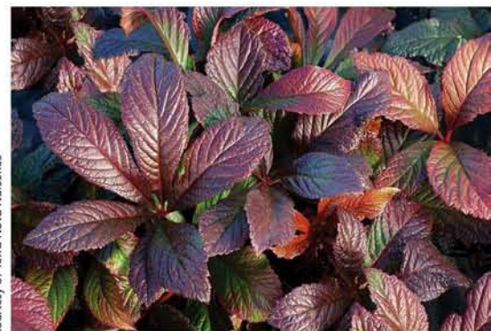
Rodgersia 'Bronze Peacock'