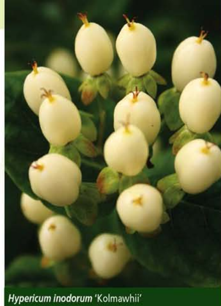
Hypericum inodorum 'Kolmawhii'