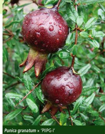
Punica granatum x 'PIPG-I'