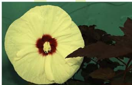
Crème Brule hibiscus

Photo courtesy of Fleming's Flower Fields