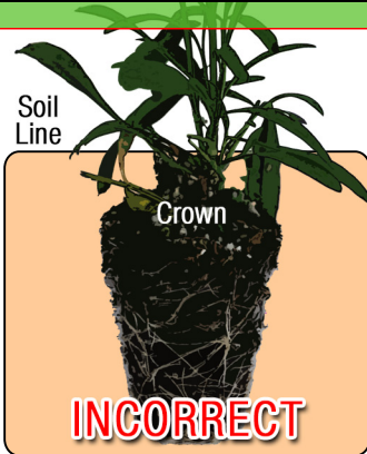
Do NOT bury the crown of the plug